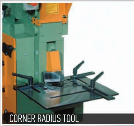
CORNER RADIUS TOOL