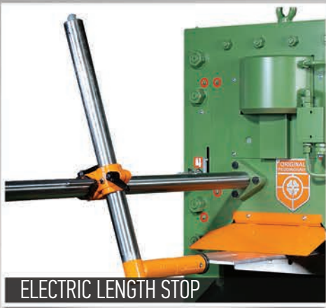
ELECTRIC LENGTH STOP