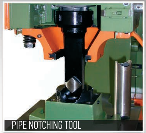
PIPE NOTCHING TOOL