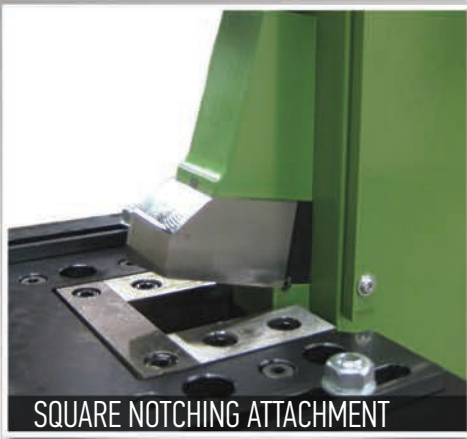
SQUARE NOTCHING ATTACHMENT